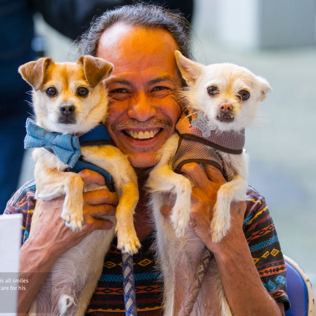
A veteran in Portland, Oregon, is all smiles after receiving free preventive care for his two dogs.