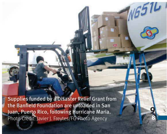
Supplies funded by a Disaster Relief Grant from the Banfield Foundation are unloaded in San Juan, Puerto Rico, following Hurricane Maria.