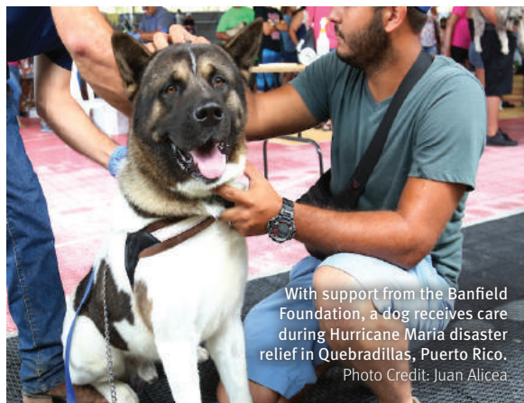
With support from the Banfield Foundation, a dog receives care during Hurricane Maria disaster relief in Quebradillas, Puerto Rico.