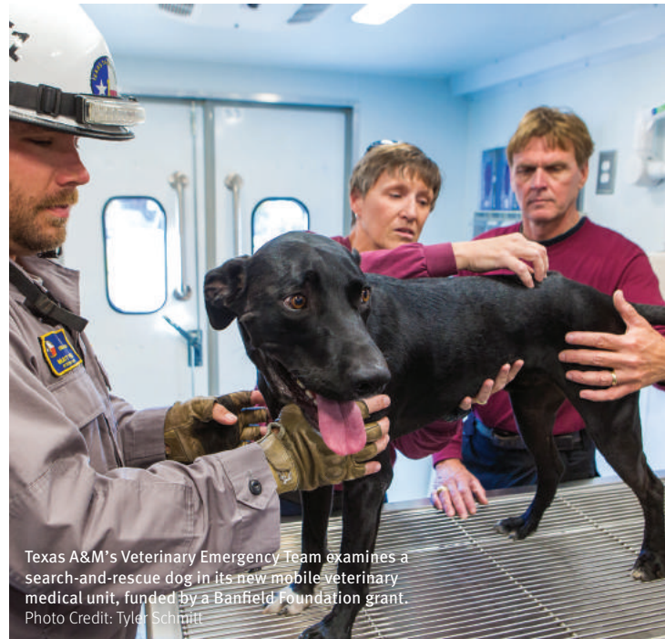
Texas A&M's Veterinary Emergency Team examines a search-and-rescue dog in its new mobile veterinary medical unit, funded by a Banfield Foundation grant.